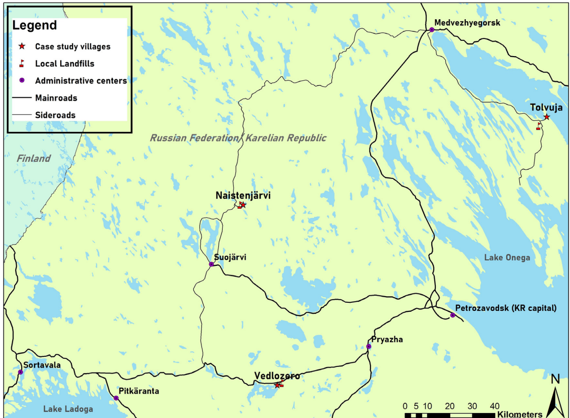
Fig. 1. Location of case study villages.

and events including their temporal developments that have created current capacities. Labours of assembling requires a focus on the conscious and unconscious workings of entities to enroll in, change or maintain ongoing assembling processes. Data collection targeted these heterogeneous ongoing and open processes of waste management and policy implementation within the villages and their relations of exteriority (Woods 2016).