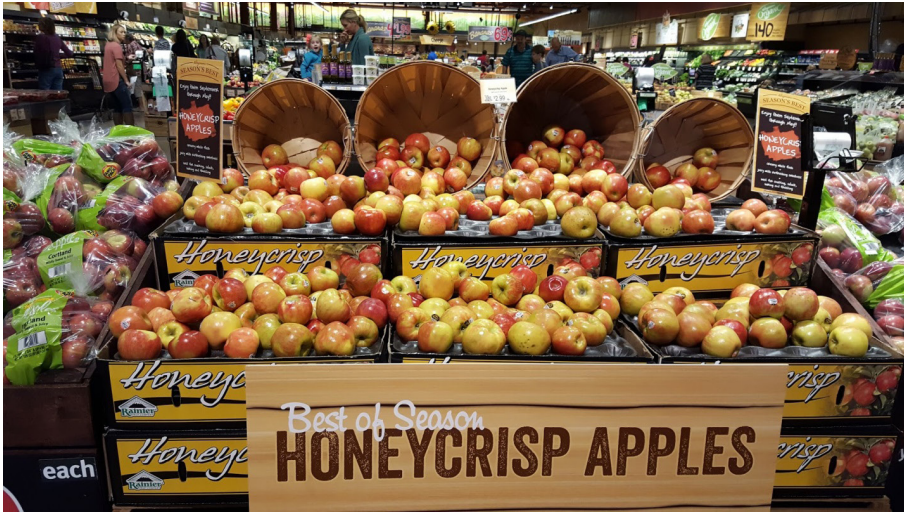
Figure 5. Seasonal display at the Fredericksburg, Virginia Wegmans, 2016.

similarly donate unsold food at the end of the market day. The practice of composting otherwise “wasted” food stands in stark contrast to food losses at traditional retailers and in home kitchens, where food is typically thrown out and sent to a landfill. In fact, the United States Department of Agriculture estimates that more food reaches landfills and incinerators than any other single material and comprises around one-fifth of municipal solid waste (Buzby et al. 2014). In 2014, only 5% of food waste was diverted from landfills or incinerators for composting (Buzby et al. 2014). More broadly, the transition to industrial agriculture points not just to a changing way we handle food waste, but also, as previously mentioned, to a shift in how we view food (Turner 2014; Campbell et al. 2017 ), from something that inherently has value and nutrients and can be composted to something that is discarded and simply “thrown away.”