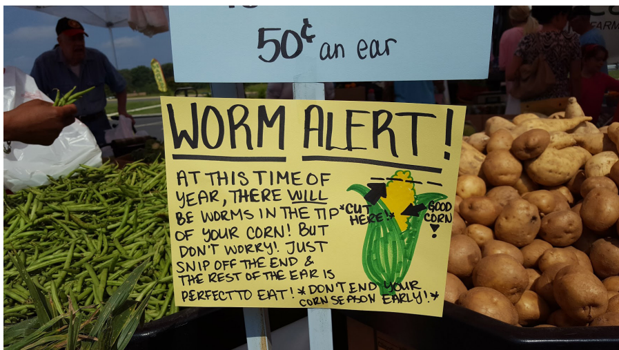
Figure 4. Sign informing customers of worms in ears of corn at the Spotsylvania County Farmers Market, 2016.

The corn has bugs in it only at the very, very top and people don't realize that so they're throwing away a perfectly good ear of corn when it's only at the top... That's why I have to make signs like that and I have to try to educate people so that they know that they're ending their corn season early for no reason. (Lisa, Spotsylvania County Farmers Market, 2016 Interview)