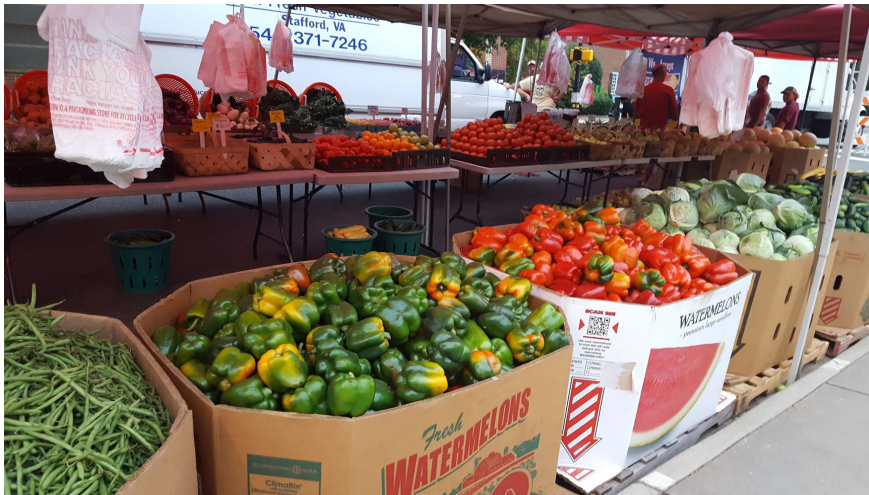
Figure 2. Large bins of produce at the Fredericksburg, Virginia Farmers Market, 2016.