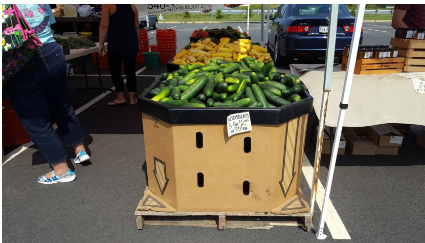
Figure 3. Strategy for displaying produce at the Spotsylvania County Farmers Market, 2016.

There are some strategies for dealing with this issue, however. One is to display products in a way that makes them appear to have a large quantity. At the Spotsylvania County Farmers Market, for example, we found similar cardboard produce boxes that had been full of products at other locations used with a plastic cap that made the box appear to be overflowing with produce when in fact the box itself was empty (Fig. 3). At the Fredericksburg Farmers Market, we found a vendor selling “salsa kits,” small produce baskets with a variety of tomatoes, peppers, and onions. Rather than discard the last few peppers or onions, or restock, they could be reconfigured in a way that would be appealing to consumers. Even at the Fredericksburg Area CSA Project, there was an emphasis on the importance of giving consumers choices. Typically at CSAs, members receive a basket or bag of produce each week that has been preselected with the member’s allotted weekly share of the harvest. A bag might contain a head of lettuce, a bunch of tomatoes, several squash, and so on. Within the past year, the Fredericksburg Area CSA Project shifted to a what they term a “Harvest Bar” approach, as Karen, one of the organizers of the CSA explained: