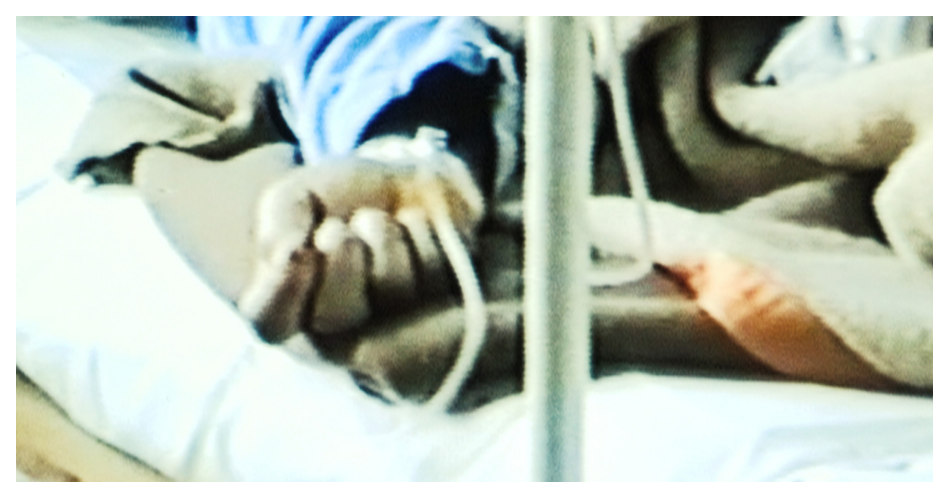
Fig. 5. Still from the documentary-poetry film Bridges <Bosnia 20>.

omit nothing of what is captured in the original films, even when facing something that seems empty of informative value, and there is seemingly nothing to see or nothing happens. Symmetrically they demand us to widen our point of view, to restore the anthropological value of the films, as films which reveal within themselves "a dilution of a special truth", a giving up of stories, or more precisely, testimony (Caruth 1995: vii).