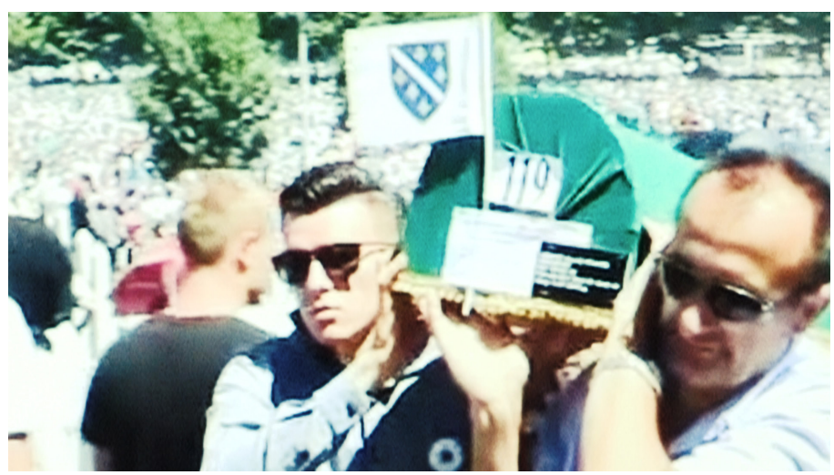
Fig. 4. Still from the documentary-poetry film Bridges <Bosnia 20>.