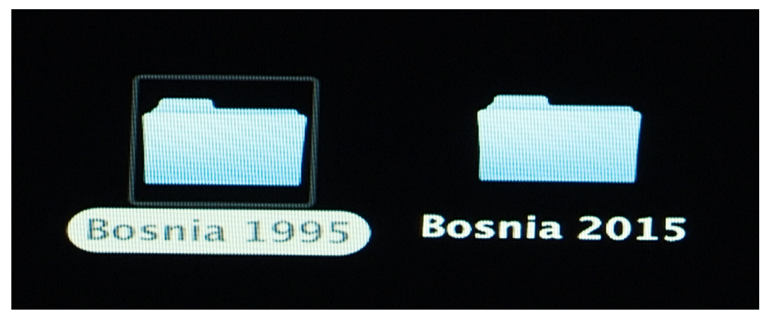
Fig. 3. Still from the documentary-poetry film Bridges <Bosnia 20>.

writings on trauma, this form of testimony is specifically seen as a way to allow a traumatic event to be 'forgotten' (Riding 2017a). For this reason, telling and re-telling a life-story may be a part of the cure, the giving-up of an important reality, or for a psychoanalyst, "the dilution of a special truth into the reassuring terms of therapy" (Caruth 1995: vii). Present within the short films that Stuart Laycock captured are Bosnian Croats, Bosniaks, and Bosnian Serbs, all receiving aid and speaking on camera at different points during the war, and on the films are bits of Bosnia-Herzegovina that rarely appeared on the nightly news broadcasts from 1992 to 1995. There are scenes that seem to linger and last too long, witnessing the traumatised people of a war-torn country, made all the more vital and essential, because they are taken by someone who is not a trained cameraman. Shaky, oddly framed, unedited, they have an almost intolerable quality. Nothing mediates the obvious trauma of those filmed, and nothing directs or 'guides' our viewing of them. The fragments of footage are for this reason more real and shocking, more disturbing and far more proximate than the packaged moving images often seen in the filming of distant war-torn regions on television. Here are 'snatched images' from a country at war, images squeezed between or snatched either side of the task-at-hand, the delivery of medical aid (Didi-Huberman 2008).