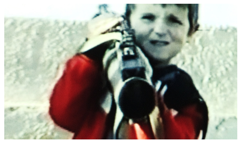
Fig. 1. Still from the documentary-poetry film Bridges <Bosnia 20> .

"poetry bears, powerful and politically productive witness to what the dominant politics in a society after genocide wants to foreclose" (Arsenijević 2011, 168). And we aim here, through the suturing together of poetry and traumatic images, to speak for those whom violence has deprived expression, historically reduced to silence; those citizens deprived of their human face (Felman 2002).