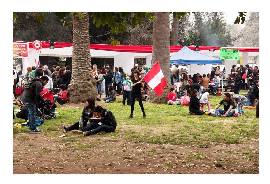
Fig. 2. Event "Peruvian National Holiday" in Quinta Normal park in Santiago de Chile.

The stands are harmoniously integrated into the park's vegetation, creating open spaces that the visitors use to gather together with their family and friends (Fig. 2). On one side, there is a huge stage, equipped with state-of-the-art concert technology. In general the event is very well organized; all the details seem to have been considered in the context of such a large event.