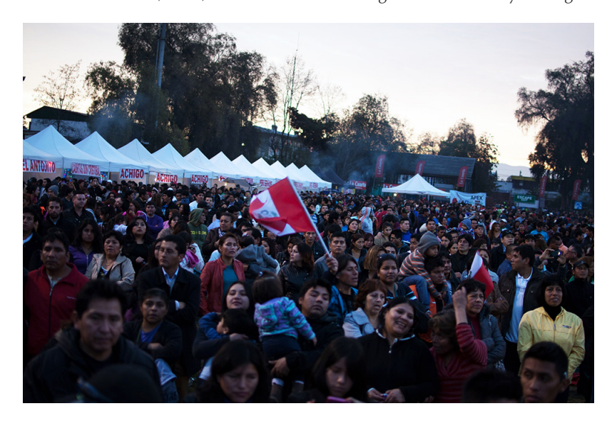
Fig. 3. Event Perú mil sabores at the Recoleta Stadium, 2013, Santiago de Chile.

feelings of nostalgia for the town left behind, sadness at the thought of family, women who miss their children, and other themes. Throughout the presentation she greets the people from different towns and cities in Peru. To conclude, the audience sings along with great emotion to the big ballad hits of the evening.