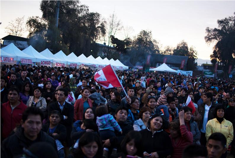
Fig. 3. Event Perú mil sabores at the Recoleta Stadium, 2013, Santiago de Chile.

feelings of nostalgia for the town left behind, sadness at the thought of family, women who miss their children, and other themes. Throughout the presentation she greets the people from different towns and cities in Peru. To conclude, the audience sings along with great emotion to the big ballad hits of the evening.