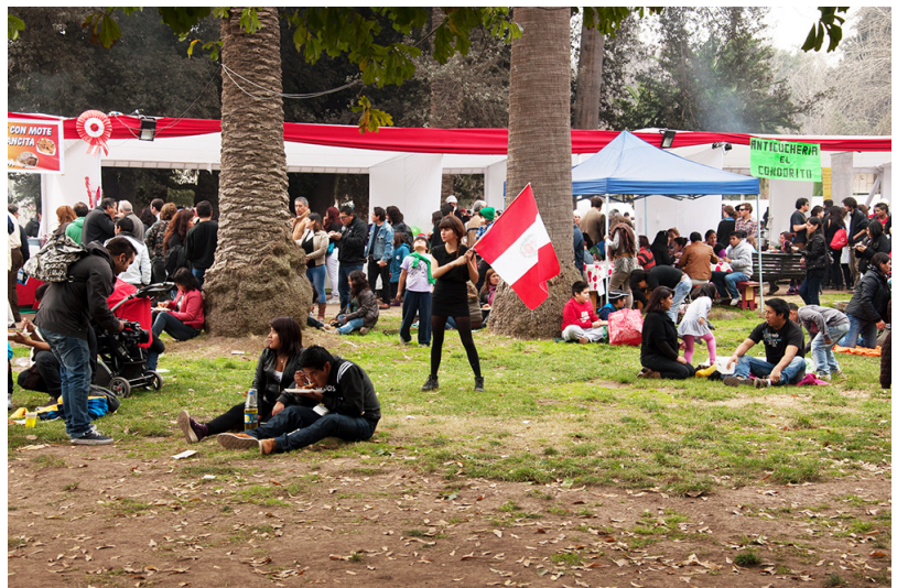
Fig. 2. Event "Peruvian National Holiday" in Quinta Normal park in Santiago de Chile.

The stands are harmoniously integrated into the park's vegetation, creating open spaces that the visitors use to gather together with their family and friends (Fig. 2). On one side, there is a huge stage, equipped with state-of-the-art concert technology. In general the event is very well organized; all the details seem to have been considered in the context of such a large event.