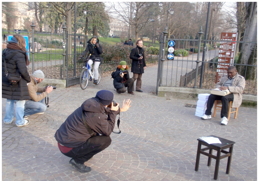
Fig. 1. Photographic set at Giardini dell’Arena, Padua, 2013.

During winter 2013, a site-specific, art performance project was undertaken in the city of Padua (North Eastern Italy, Veneto Region). Promoted by an informal group of Paduan social activists and civic artists (named ‘SocietàPerAzioni’) together with immigrants and student associations within the wider frame of an institutional project on the cultural regeneration of public urban spaces, the “In Vista” project involved young migrants as performers. Most of the young migrants involved in the “In Vista” project belonged to a group of Italian and non-Italian youngsters called “Rete Oltre i Confini di Cittadinanza” (Network Beyond the Boundaries of Citizenship), created through joint projects promoted by intercultural local associations and the Municipality of Padua. The creative team of ‘SocietàPerAzioni’ asked the migrants to autonomously choose locations in the city as sets for public photography shoots. The script for every performance was first conceived by the performers and then discussed and developed in collaboration with the creative team. During the performance, members of the creative team took photographs, thus placing the presence and the acts of the young migrants “in sight” (“in vista”) against the urban backdrop (Fig. 1). The performances pro-