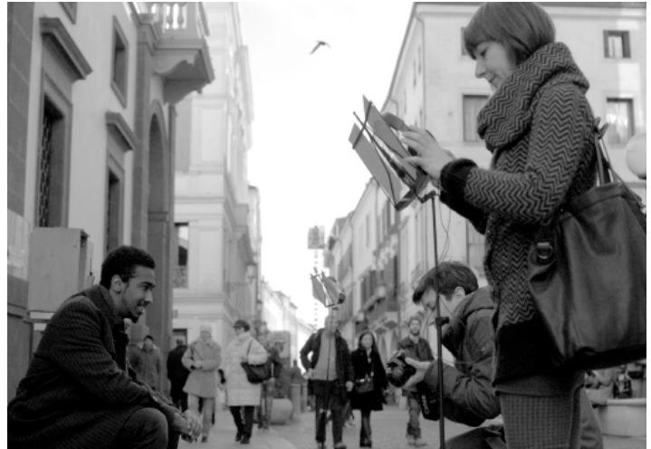
Fig. 10. Photographic set in front of Palazzo Bo, Padua, 2013.

“their belonging to the city and the nation as more than one of just transience” (Robertson 2013: 981; emphasis added).