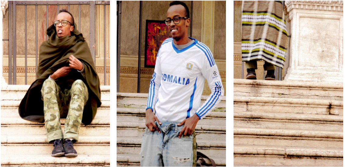
Fig. 7. Jabir at Loggia del Consiglio, Padua, 2013.

upon her achievement of tranquillity after a difficult period of adaptation to new faces, new symbols and new voices. The idea of finally making herself at home is not related to the city of Padua, but to Italy. The art museum, in her words, functions not as the symbol of an abstract, distant national culture, but as one among a constellation of concrete spaces spread all over the national territory which could become 'home'. Ha Sha dares to live in those spaces as if they were her home. The performance, then, factually transforms the Italian art museum into the migrant's living room, with Ha Sha reading on a sofa and drinking tea.