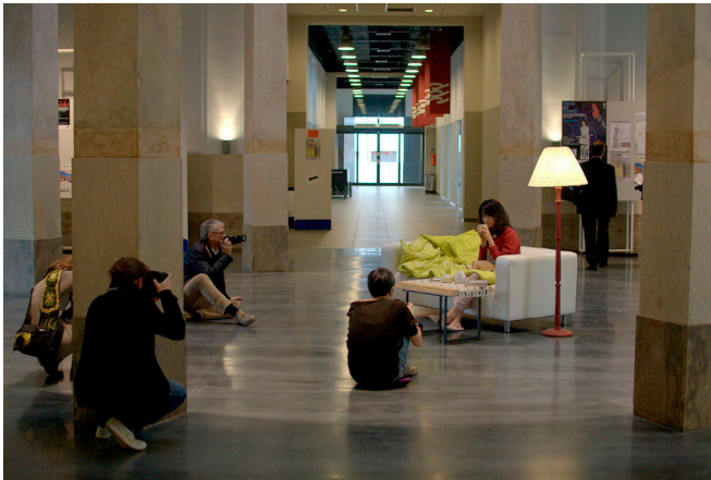
Fig. 9. Ha-Sha at Centro San Gaetano, Padua, 2013.

The scale complexity of our times implies that different scales not only are interconnected but also function simultaneously, generating scale bending moments (Smith 2004: 208) and processes of “scale jumping”, whereby claims at one geographical scale are expanded to another. Referring to the scale debate, Featherstone et al. (2007: 386; emphasis added) argue that grounded transnational practices should be seen as constituted through dynamic relations with the nation and through particular places in both human and non-human