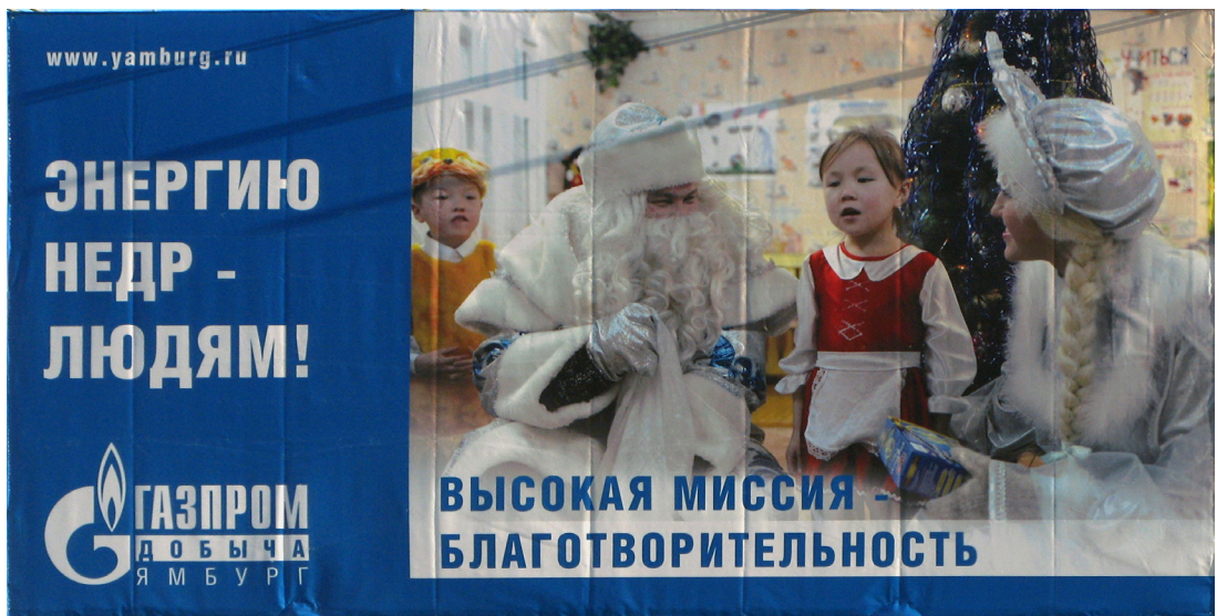
Fig. 2. Advertisement: “The energy from natural resources for the people. The great mission: welfare”.

The ascription of meaning to experienced spaces takes place within an amalgam of local and national practices, of agents and the global political economy. People travel half of a week to Novy Urengoy and gas travels one week to the European gas distribution hub Baumgarten in Europe (Zirm