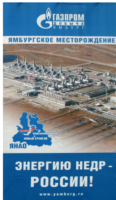
Fig. 1. Advertisement: "The energy from natural resources for Russia".

Long-distance commuters as well as local oil and gas workers are as closely connected to oil and gas and their socio-economic value, as are the industry and the state. These natural resources are emotionally and symbolically a part of everyday social life, not only for workers in the industry but for the entire region. The widely used drinking toast – "to you, to us, to oil and gas" – reveals the strong emotional connection to these natural resources "for Russia" (Fig. 1), that "feed Russia" and