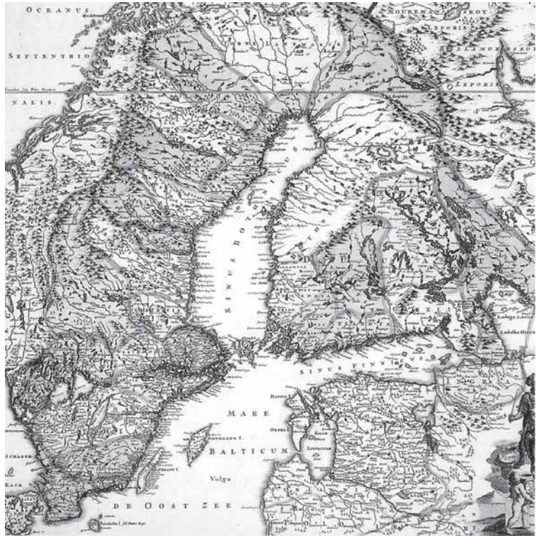
Fig. 2. Johann Baptist Homann: Regni Sueciae in omnes suas Subjacentes Provincias accurate divisi Tabula Generalis . Nürnberg 1737. The map from the period of Sweden as a Great Power portrays the kingdom as composed of provinces. Finland figures on the map in a form that could today be interpreted as a political-administrative unity. Recent historical research does not lend support to such an interpretation, however. (Reproduced from Fredrikson 1993: 72, with permission)

territorial shaping of Finland as a political-administrative whole for the first time. Seen from the outside, however, the association of Finland with Russia signified the relaxation of the Scandinavian connection. This was quickly recognised in some maps showing the North of Europe (Fig. 3).