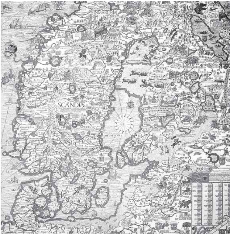
Fig. 1. Olaus Magnus: Carta Marina et Descriptio Septentrionalium Terrarum . Venice 1539. The map is unusually detailed and it has influenced the conceptions and images of the European North significantly. (Reproduced from Fredrikson 1993: 24–25, with permission)

create historical testimony to the cultural presence of the Finns on the Finnish peninsula. Written on maps these names take on a particular aura of fixity, an almost self-proclaimed physical presence that does not require further proof or justification. As hybrids of textual and pictorial representation maps help in fortifying the idea of a territorially definable 'Finnish' culture.