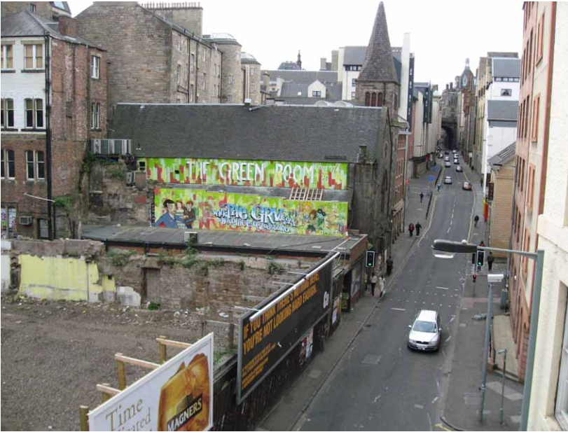
Fig. 6. The Cowgate viewed from the South Bridge in 2007 with the boarded up fire site to the left.