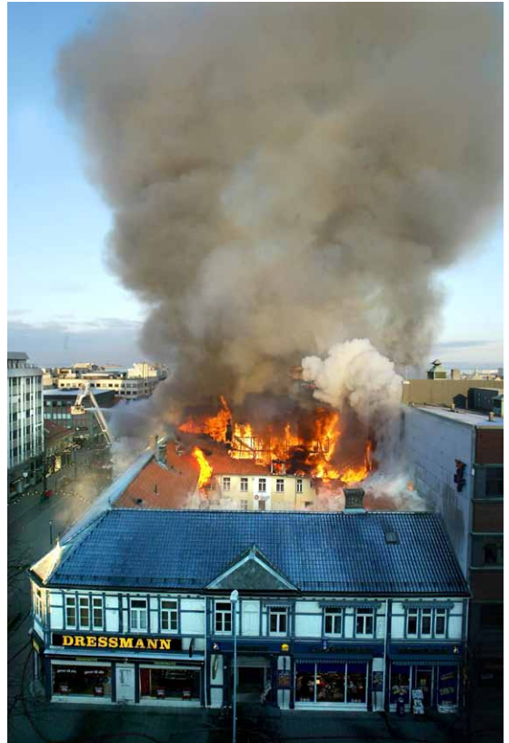
Fig. 1. The fire in the centre of Trondheim on 7 December 2002. The fire spread to engulf the wooden building in the foreground at the southern end of the fire site. The buildings destroyed by the fire were built in the 1740s and were typical of the building style of the period, although the large shop windows were of later date.

Like other types of landscape change, changes caused by catastrophic fires in the landscape have both material and cognitive dimensions. Materially the physical landscape undergoes change both through the disappearance of the existing urban fabric on the site of the fire as well as through the creation of the new landscape that results from the redevelopment of the site – or not, as the case might be. The cognitive dimension includes the values attributed to the landscape before the fire and the feelings of loss that the fire entails, as well as various ideas concerning the future of the fire site. The result is often negotiation between differ-