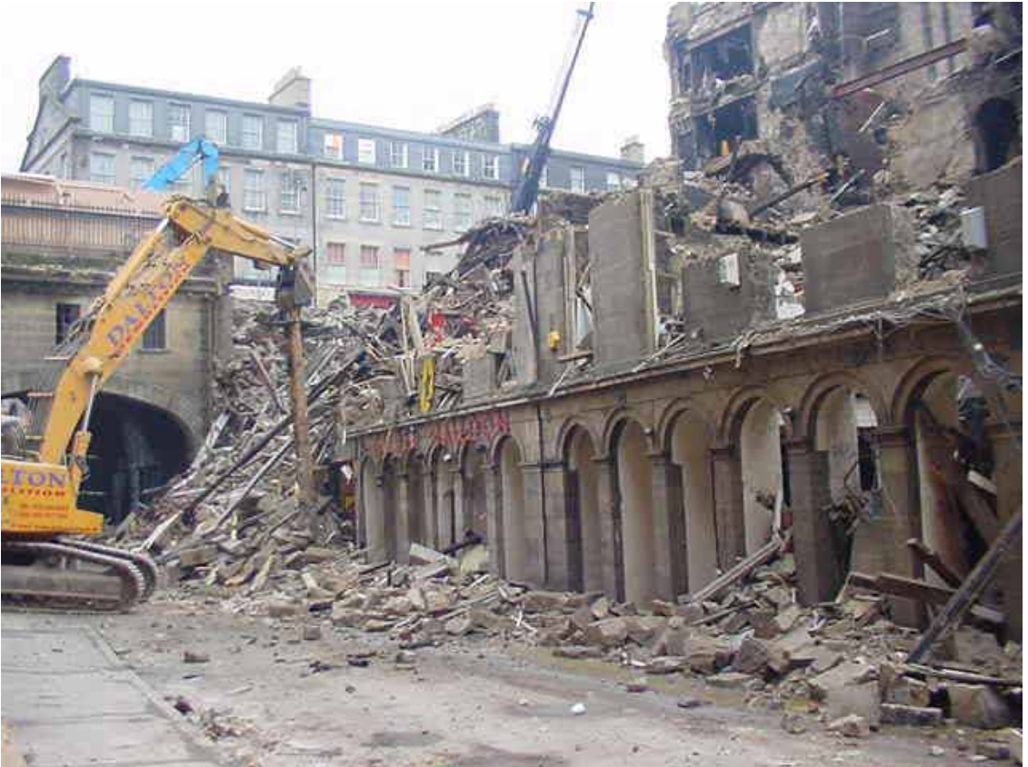
Fig. 3. The fire site in Edinburgh viewed from the Cowgate a few days after the fire. Demolition work was taking place to make the site safe. Part of the South Bridge is on the left, and the buildings in the background on the other side of the 18th-century urban viaduct are similar to those destroyed. Photo: Robin Adamson, City Development Department, City of Edinburgh Council. Published with permission.