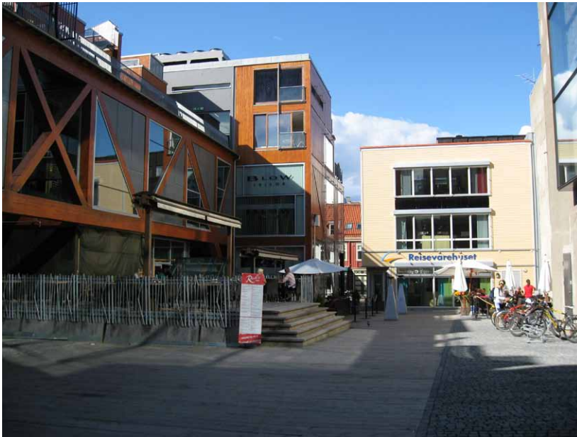
Fig. 5. The reconstructed line of the medieval street, Borkegata, forming an open backyard behind the new building constructed on the fire site (left) as it appeared in 2008. The buildings on the right and straight ahead are brick buildings that survived the fire.

which can allow occupied land to become vacant and available for building. Such factors include instruments such as planning consent, building permits, compulsory purchase, agreements allowing private interests to develop or redevelop a site, or total redevelopment under the auspices of public authorities.