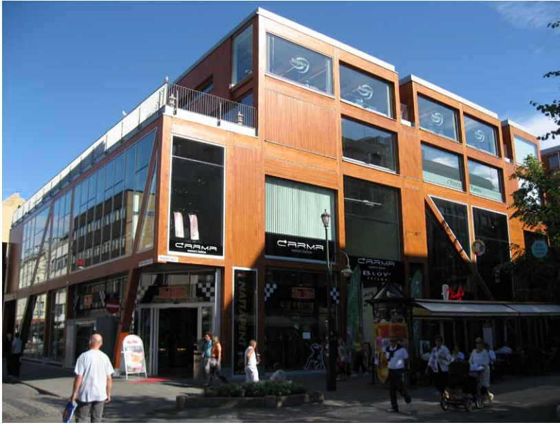
Fig. 4. The south-western corner of the new building constructed on the fire site in Trondheim as it appeared in 2008.