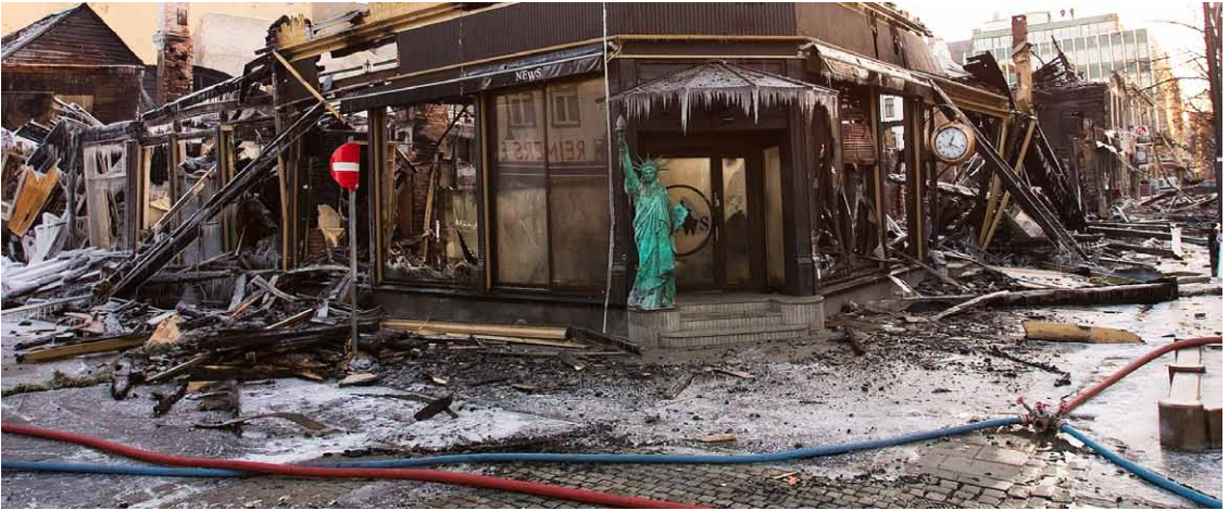
Fig. 2. The north-western corner of the fire site in Trondheim a few days after the fire. The miniature statue of liberty marked the entrance to a night club. Frosty weather led the water used to extinguish the fire to freeze to icicles. Photo: Roger Midtstraum. Published with permission.