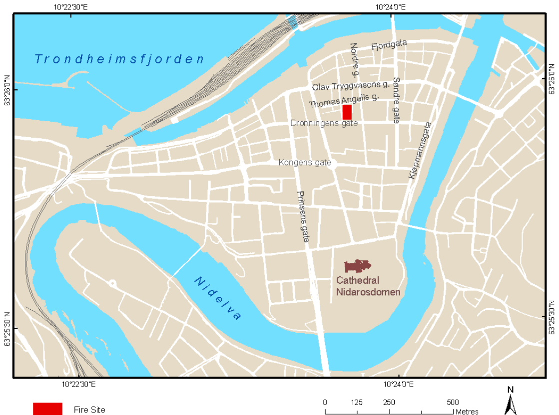
Fig. 8. Map of Central Trondheim, showing the location of the fire site.

act; and what were the reactions of non-governmental organizations and the public.