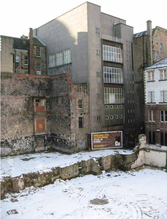
Fig. 7. The fire site in Edinburgh viewed from the South Bridge in 2009. The building in the centre is the back of Adam House, an A-listed building in 1950s architecture.

as parking lots, new open spaces or redevelopment, or may simply remain empty. Fires destroy, but at the same time provide potential for something new. This potential may or may not be realized. Where realized, this provides wide scope for developers, architects and city planners to shape the new urban landscape on the fire site. An opportunity is provided for implementing ideas that accord with prevailing planning ideologies and fashions.