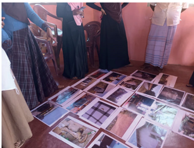
Fig. 3 Group work selecting photos in Mannar workshop

Participants were divided into smaller groups during the workshops. They organized photo presentations by category or theme to facilitate focused storytelling, highlight diversity, and encourage collective reflection. Researchers did not interfere with the discussions or the selection process, allowing participants to independently prepare and present their collections. Workshops were held in community or public halls.