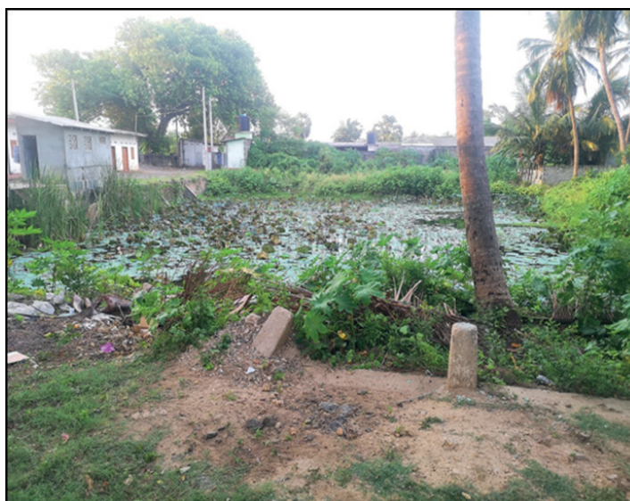
Fig. 5 Photovoice picture illustrating life prior to eviction: memories of childhood

There is a place called the small mosque on our Muslim College Road. When we were 9 or 10 years old, we used to sit on the wall and talk about that pond and the flowers in the pond and eat the petals of those flowers. During that time, there were ornamental fish in that pond, and we played by catching them. Sometimes our Tamil friends would pick large flowers in that pond to keep for their gods. Also, that pond had been used to fulfill the basic needs of people. After we were chased in 1990, the pond was covered with sedge grass.... The lotus and other plants had disappeared. There was only trash and wild plants there. This is a place where we played and had memories; therefore, we feel sad when we see this pond. I'm unable to describe that sadness in words. (PV 6, male, 38 years, Jaffna).