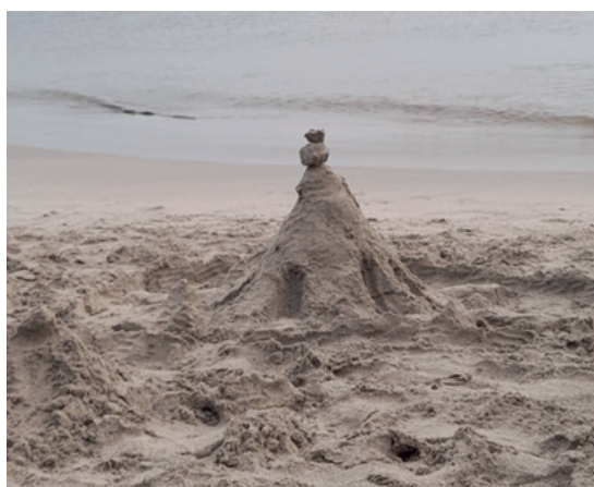
Fig. 7 Photovoice illustration of memories of displacement

We lived in Erukalampidy. The LTTE asked all families to leave within 2 hours, and later it was extended to 2 days as the church fathers requested them. We reached the seashore by walking for 5 miles. My mother and my grandmother reached there with my six sisters, a brother and me. When we were on the seashore, the LTTE also was there. We had to stay there during the sunny and rainy times. The girls who were in their menstruation days struggled a lot to change their clothes.... People used to raise their sarees and let the girls change their clothes. Even girls struggled to pass urine because the LTTE was there beyond a certain distance. People dug a hole in the beach, covered it with sarees, and used that as a toilet. That beach was like a resurrection ground (as described in Islam). We got that much punishment without making any mistakes (PV 4, female, 55 years, Puttalam).