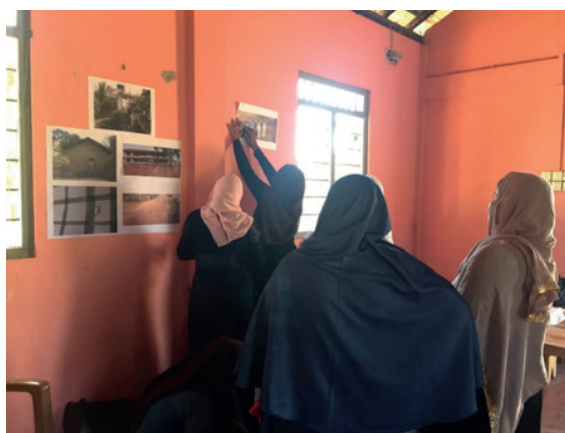
Fig. 10 Active engagement of group of females in the selection and displaying photos in the Mannar workshop

Including an image from the Mannar workshop (Figure 10), where a group of women are seen collaboratively selecting and arranging photographs for display, would be particularly valuable here. It visually captures the participatory spirit and collective decision-making that defined the project's methodology.