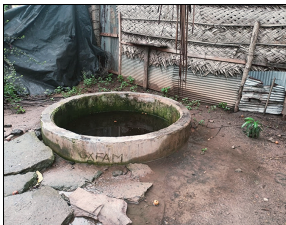
Fig. 6 Photovoice illustration of life in camp: access to water and sanitation

Her account highlights the significance of humanitarian support while simultaneously drawing attention to the difficult conditions faced before such aid was available. The photograph she provided visually complemented her narrative, showing the infrastructure that eventually eased the burden.