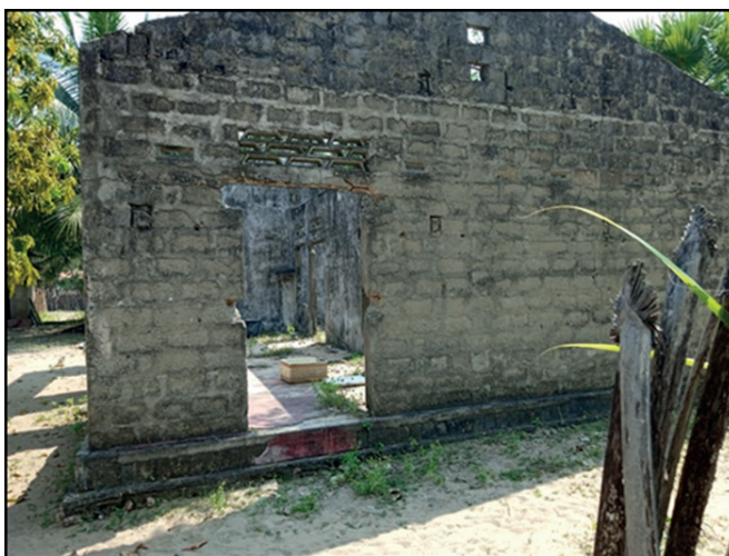
Fig. 4 Photovoice picture illustrating life prior to eviction: memories of house

The reason I intend to tell you this is because we built this house with many difficulties. We moved to our new house in May 1990. We were chased soon after we moved to our new house and started to live happily.... They (LTTE) asked us to hand over the keys. At that time, we were very sad because we had to leave all our things in the house. In 2004, we went there to see the house. When we saw the situation of the house, which we built with difficulties, we were more upset (PV 5, female, 50 years, Puttalam).