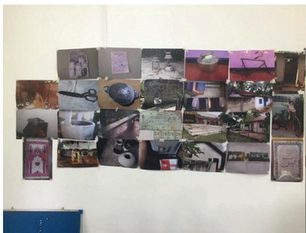
Fig. 2 Photo collection in Puttalam workshop

Following the photography and interviews, three separate perspective workshops were held in Puttalam, Mannar, and Jaffna with the 45 Photovoice participants. These workshops aimed to raise awareness and inform policy and practice. In addition to the participants, around 10 guests — community leaders, government officials, and NGO representatives — were invited to each workshop, bringing the total number of attendees to approximately 25 per site. Each three-hour event included the display of the 45 selected photos.