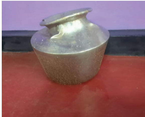
Fig. 8 Photovoice illustration of memories of displacement: daily life- a pot

When my mother was displaced in 1990, she had many things which she received as presents for her marriage which was held in 1989 but she couldn't bring anything with her. However, suddenly she had thought about bringing some rice, sugar, and flour with her to make food wherever they got displaced. At that time, she had put those in this pot and brought them with her by boat, and used that for a longer period after the eviction. Still, my mother keeps this silver pot as a memorable thing. (PV 1, Female, 33 Years, Puttalam)