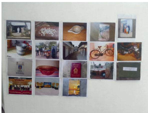
Fig. 9 Photo collection in Jaffna workshop

Beyond personal stories, the workshops allowed participants to collaboratively categorize and contextualize their experiences. For instance, the Jaffna group grouped their photos into three timeframes: life before 1990, the displacement years after 2002, and resettlement in 2023. This structured reflection helped illuminate how perceptions of place and identity evolved over time. The group's presentation traced the transformation of a single village through these stages — capturing its pre-war architecture, damaged remains, and the reconstructed homes of returnees. A compelling photo series here would be a triptych: one image from each period, placed side by side, capturing change and continuity.