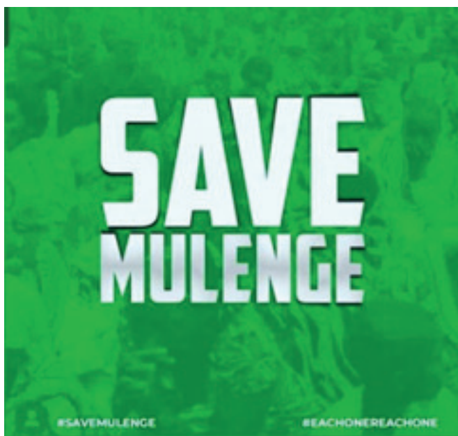
Fig. 1 #Save Mulenge — Picture of the campaign

Youth within the broader and near diaspora have consistently faced obstacles in actively engaging in the Banyamulenge diasporic humanitarian sphere due to the entrenched nature of humanitarianism in traditional systems — via the system of mutualities. However, the onset of the pandemic marked a pivotal period when certain frustrations catalyzed the emergence of new initiatives predominantly led by the youth. For example, the social media hashtag #SaveMulenge, displayed in green, emerged as a call for peace and swift intervention by the international community. Banyamulenge youths worldwide began utilizing hashtags such as #SaveMulenge, #EachOneReachOne, and #SkipaMealToSaveMulenge (see Figure 1).