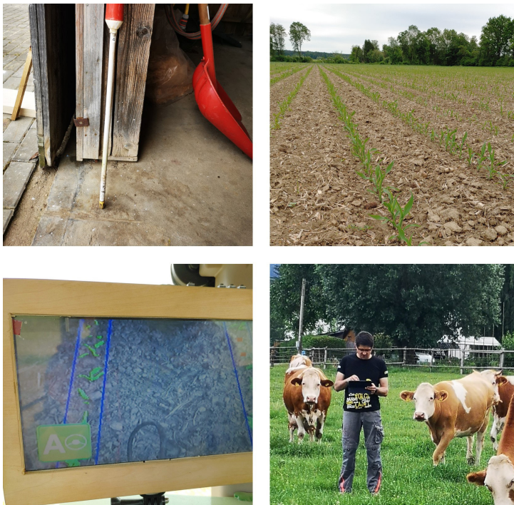
Fig. 1. Images taken by farmers as part of the Photovoice method, exemplary (a).

At the beginning of the interviews, participants were shown their images printed out on paper in a random order and asked to form clusters based on thematic context they identified like work alleviation on the field, automation, visual surveillance, weather forecast interpretation, indoor livestock keeping, farm management, office management and administrative duties, marketing et cetera . These clusters and the associated images were discussed in detail regarding the semantic content and personal relevance. For a better illustration, Figure 1 shows four images that were taken before the interviews by different participants who, through them, referred to the following topics: the collection of data with digital sensory equipment to gain information otherwise invisible for human senses, higher accuracy in plant cultivation through automation, and animal welfare.