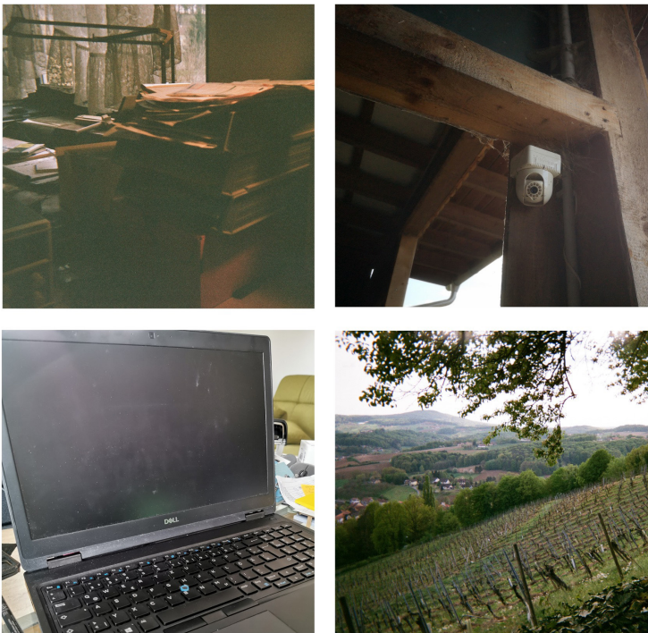
Fig. 2. Images taken by farmers as part of the Photovoice method, exemplary (b).