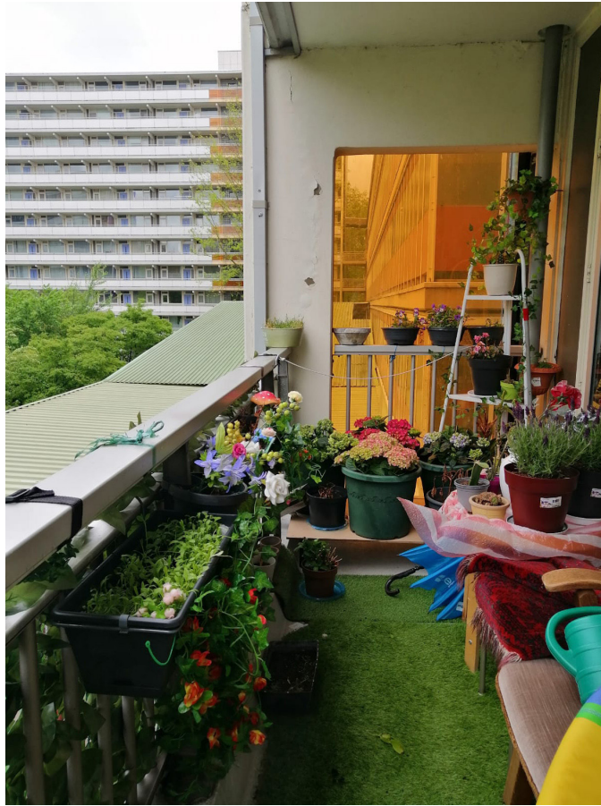
Fig. 5. The balcony as an in-between space between public and private.

refugees' agency into account, it becomes clear that, to a certain extent, there is a reordering taking place, when attachments grow beyond the static territories that were defined as their new 'home' by the government.