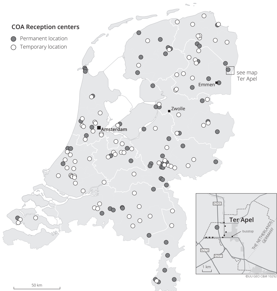
Fig. 1. Location of reception centres in the Netherlands.

I did not have any idea for trains because in Syria we didn't use the train or tram or metro. They just said 'You can go to Ter Apel and this dagkaart is for free'. I looked at the map – I'm very good with maps – but I didn't know what to do with it because I don't know the train, the tram, the metro system. I spoke a little bit of English at the time but I was afraid to ask people because I don't know these people and I heard that European people don't like people from the Middle East, especially those with black hair and a beard. So I thought maybe they would look at me and think 'He is dangerous'. But I had no choice and asked a man how to get to Ter Apel, because I'm afraid to ask women – maybe she will get the police on to me or something. I don't know. But the man did not know anything and then a woman came to me – she was 45 or something – and she said 'Can I help you?'. I told her 'If you would'. I want to go to this address – to Ter Apel – but I don't know how to get there. She told me, okay, follow me. And we sat and she invited me to coffee and she told me 'Okay, take this train and then that one' and I understood a little bit and I went to Zwolle first and then to Emmen and then Ter Apel.