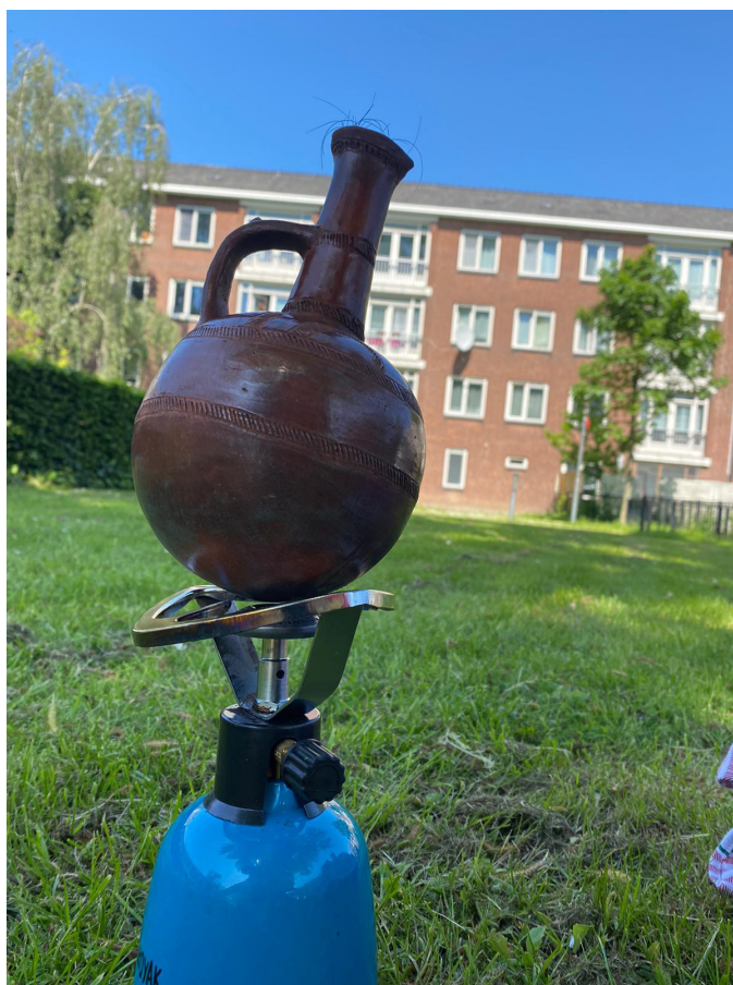
Fig. 4. Eritrean coffee ritual in the park with friends.

Going to the park and meeting up with friends was also often mentioned as a means to get away from the house and enjoy oneself. Eritrean coffee rituals were sometimes moved from private to public spaces, as Figure 4 from one of the photo-voice workshops shows.