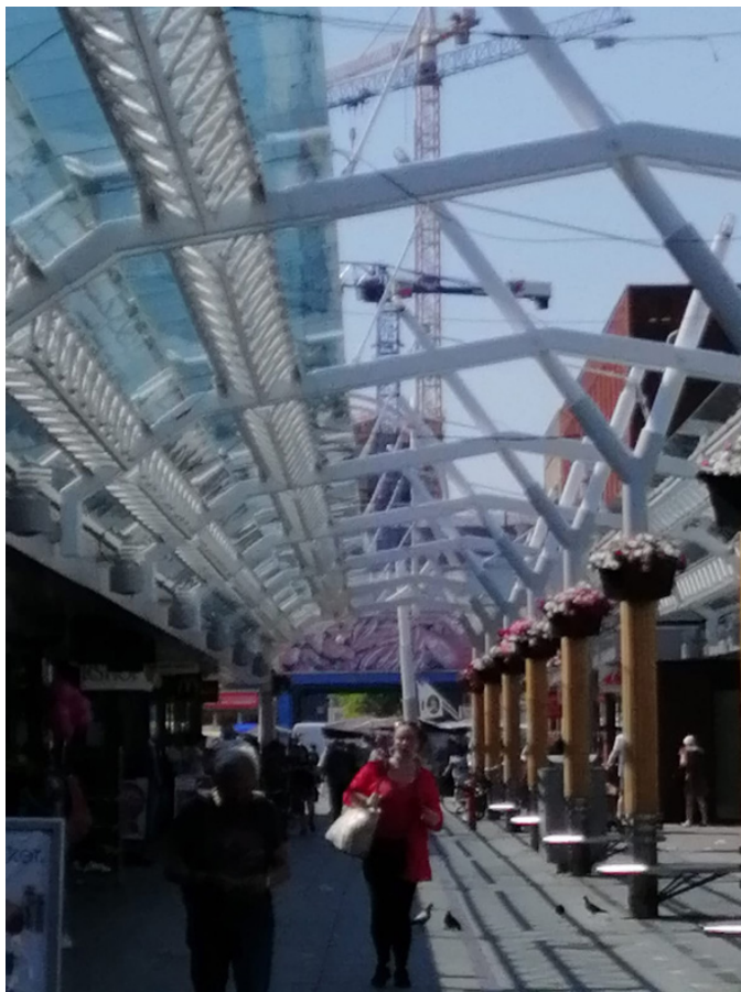
Fig. 3. Shopping Center Boven 't IJ.

Nonetheless, the participants described many insecurities and anxieties at the local level, always in relation to specific places and sometimes specific times of the day.