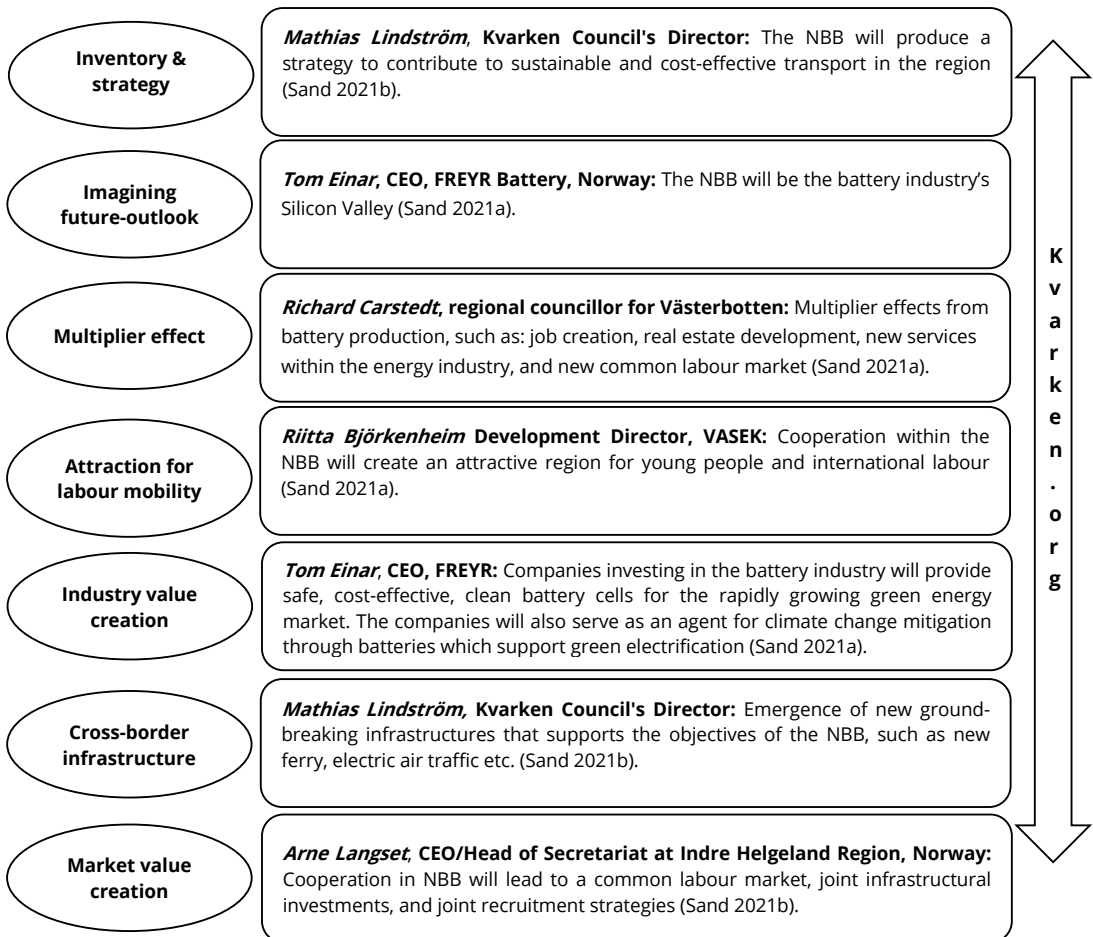
Fig. 2. The perspective of key stakeholders on battery production and the NBB.