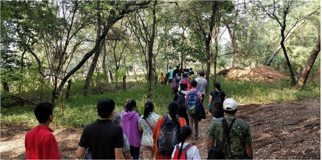
Fig. 2. Bird walks.