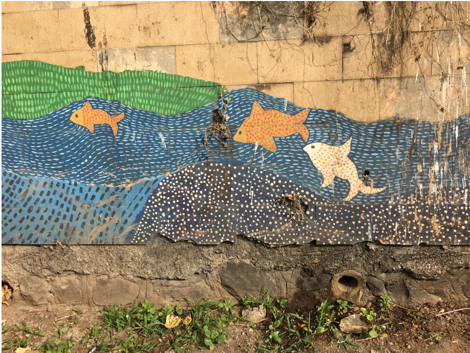
Fig. 6. The rippling river with frolicking fish.