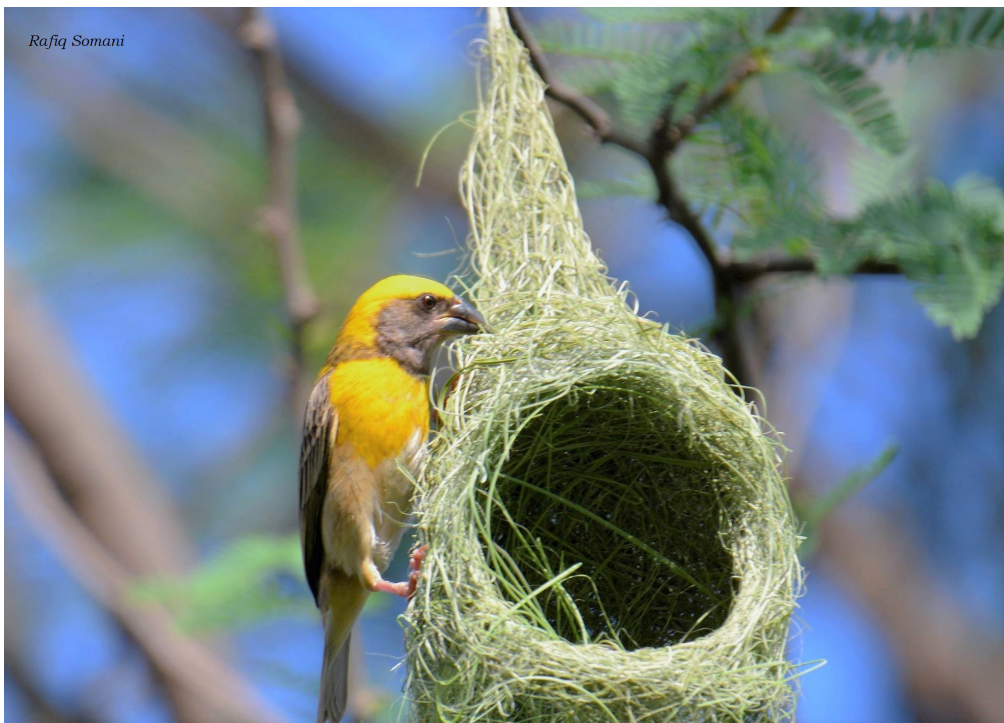
Fig. 8. The Baya Weaver bird.

The refreshing creativity of the mural art deepens the promise of seeing rare bird species, listening to birdsong and enjoying an energising urban nature walk along the river. This place across the bridge is away from gated mansions of the wealthy in Koregaon Park that offer walkers shady broad laneways with ancient banyan trees. Walking along a 'kuccha' (unpaved) path in the thick forest Rita and I feel like the only wanderers in this green zone along the Mula-Mutha river. As the path winds and narrows my disappointment deepens – shards of glass, empty bottles, plastic bags, wastepaper as well as human and animal excreta mingle with piles of construction waste. These innumerable scattered mounds and mountains of waste lie in the shadow of large yellow cranes beyond the park boundary wall promising rapid transit in Pune city, a 'hill station' that is experiencing unprecedented heat waves with temperatures over 40 C in summer. Piles of garbage beneath trees with thick foliage, in muddy as well as cavernous ditches and along the riverbank are interspersed with innumerable stagnant pools and ponds that are breeding grounds for mosquitoes. We take each step with extreme care as we look out for birds, follow their twitter and attempt to find a path to the riverbank after asking a few park staff herding pigs and buffaloes. It is at this moment that we meet another Puneekar, a walker carrying a sophisticated camera with a powerful zoom lens (Fig. 8).