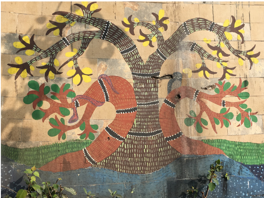
Fig. 5. Jewelled tree trunks and blooming flowers.