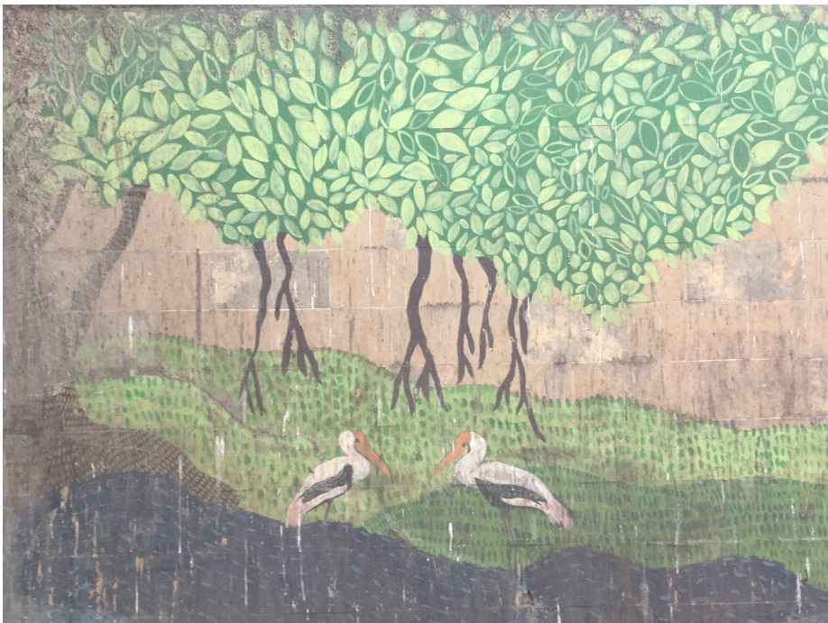
Fig. 7. Painted storks enjoying the rain.