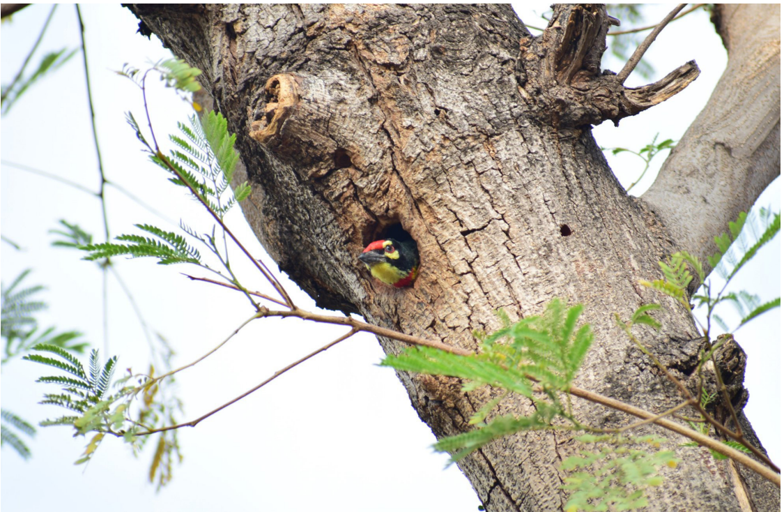
Fig. 3. Coppersmith Barbet.