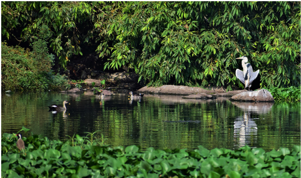
Fig. 1. Birds at the Salim Ali Biodiversity Park and Bird Sanctuary.

Wake up the archers of the earth It is time to worship the water There is no time to rest We must work hard to create Don't throw away the water Your existence depends on it Water is the only hope The only support of mankind Let us save rainwater together Water in wells Water in springs And also tap water Earth cannot survive without water Even animals, birds and we cannot Save water and secure tomorrow And we can save the entire world Where is the burbling water now? And where is the dripping drop? ... (Dharmaraj Patil)