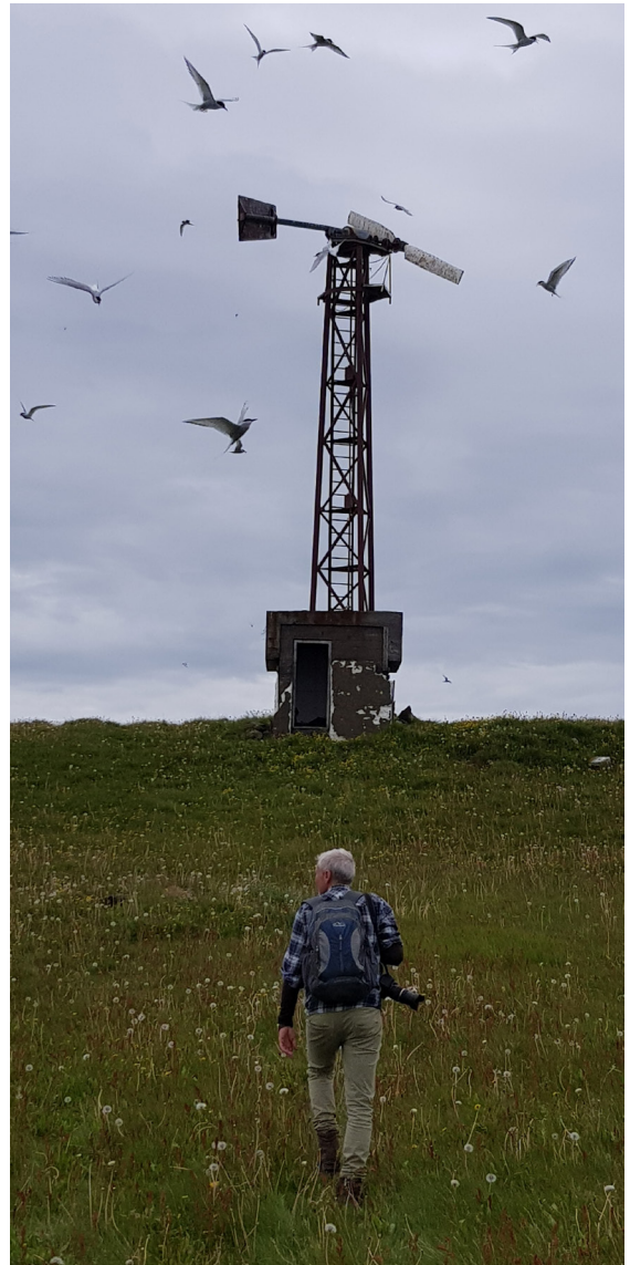
Fig. 2. The experimental windmill on Grímsey. Picture by Huijbens, 23 July 2021.

So why not wind? Some interesting experimentation with wind energy did in fact take place on the island in the early 1980s. Scientists from the University of Iceland erected a rather small experimental wind turbine, albeit not for generating electricity, but to heat water directly through friction (Dagur 1982). Some similar experiments were also being done in other places at this time, mainly by individual enthusiasts and tinkerers. The novel idea was apparently proven to be workable, but the friction mechanism in the Grímsey turbine was prone to failure (Dagur 1985, 1986). After a few years the trial was wound down, and similar experiments taking place elsewhere in Iceland also faded away. It contributed to the lacklustre interest that oil prices eventually dropped again, so the incentive to continue with the development of the technology was removed. The turbine is still standing at the southern end of the island, its silhouette visible from the village, although upon closer inspection it is not looking particularly attractive after years of disuse and neglect – if it ever did (Fig. 2).