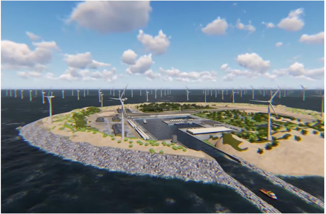
Fig. 1. Dogger Bank Island Link island.